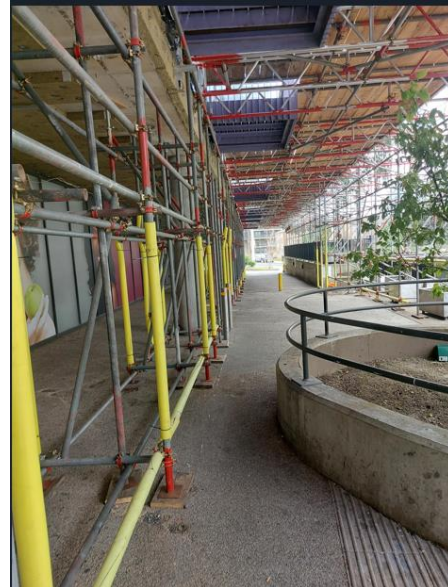
Elevation 2 Warton Road (Ruby/Opal)

Works to strike the scaffold in this location have already started and will be completed by end of June 2024.